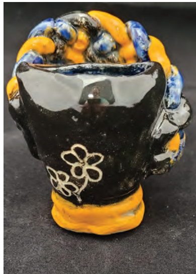
Belle Monica Braidification Overload