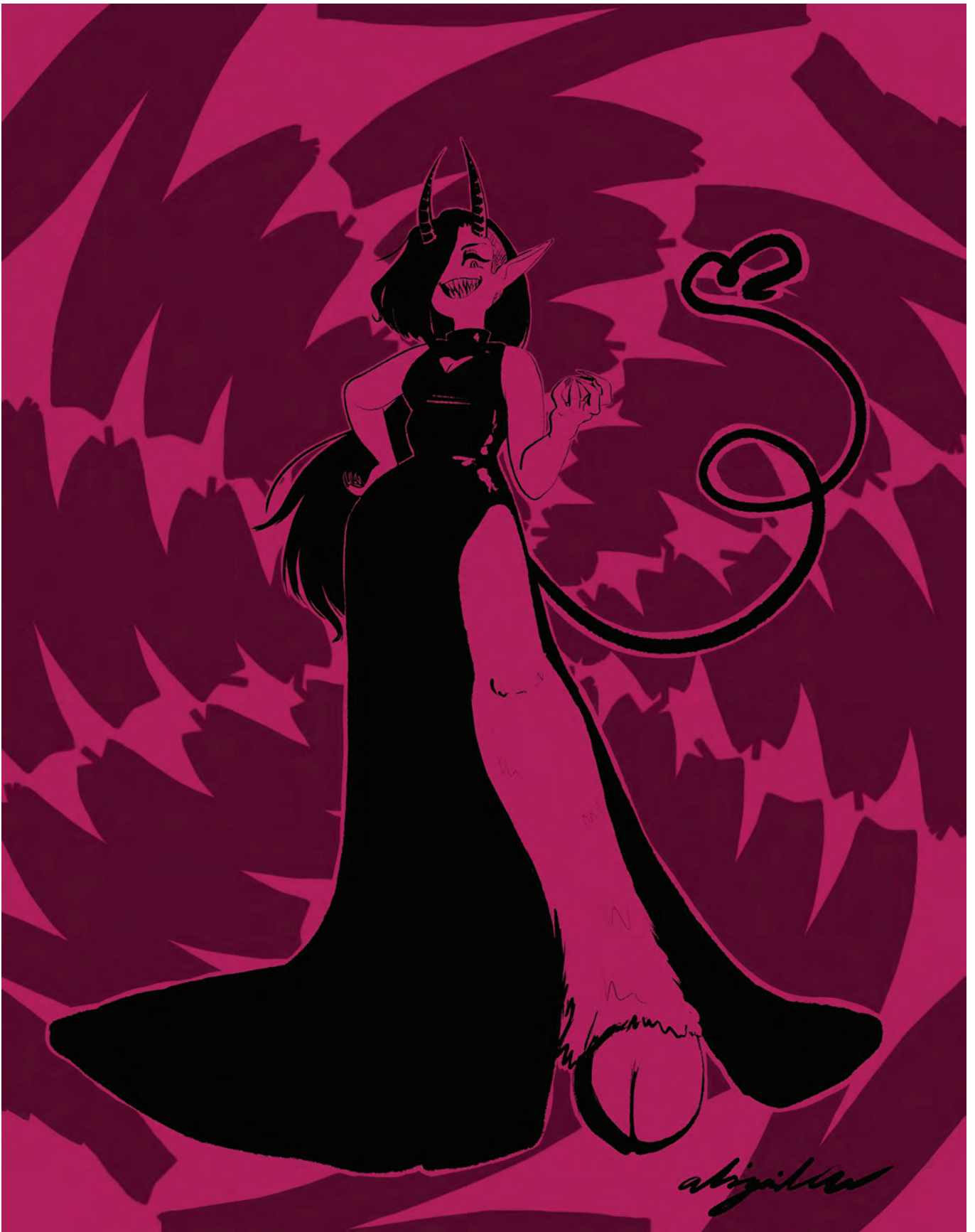
Abigail Orr Heart - Eater