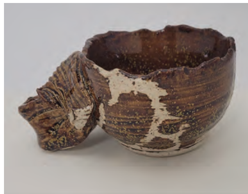
Belle Monica Ceramic Tree Mug...Thing