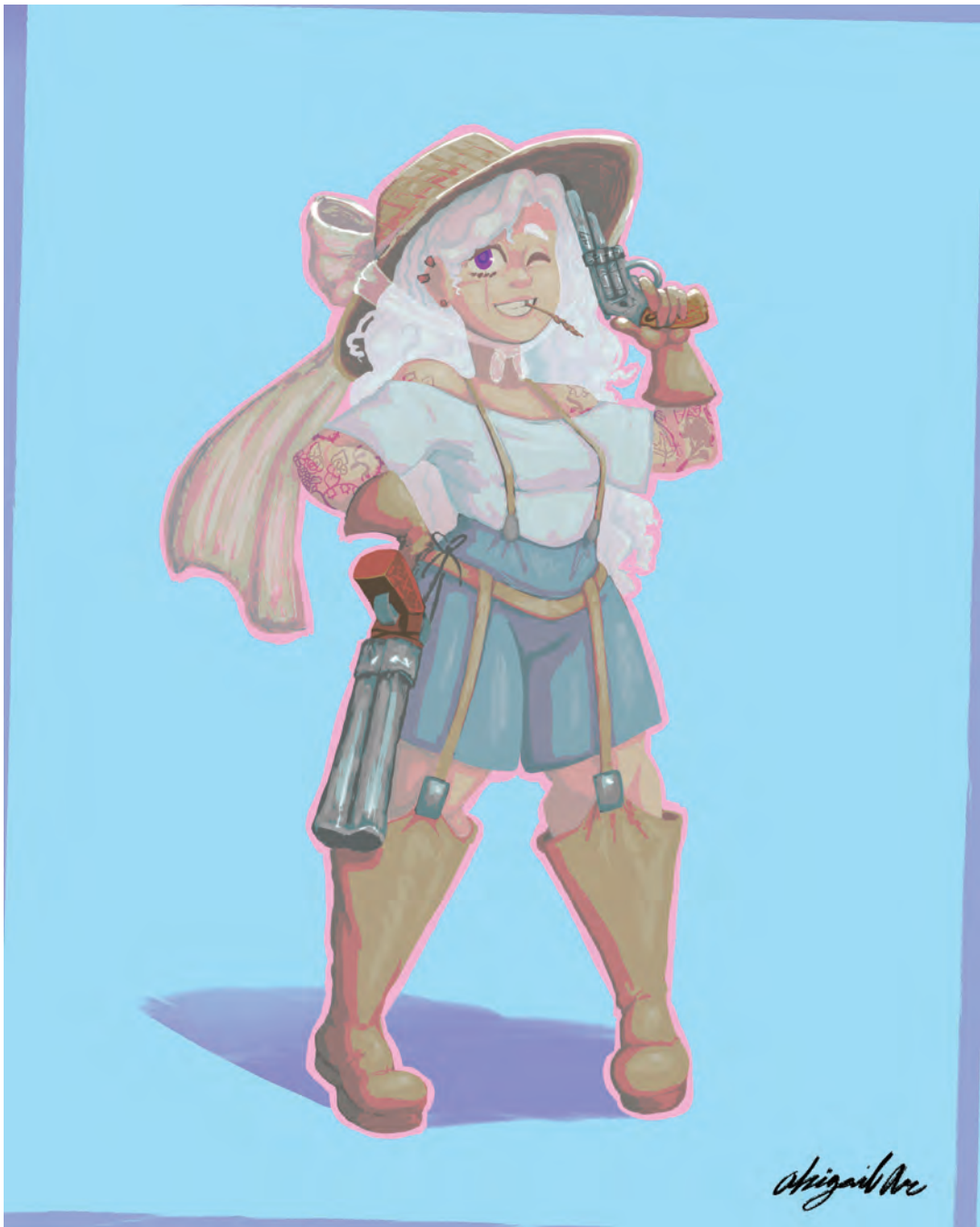
Abigail Orr Lucky #7