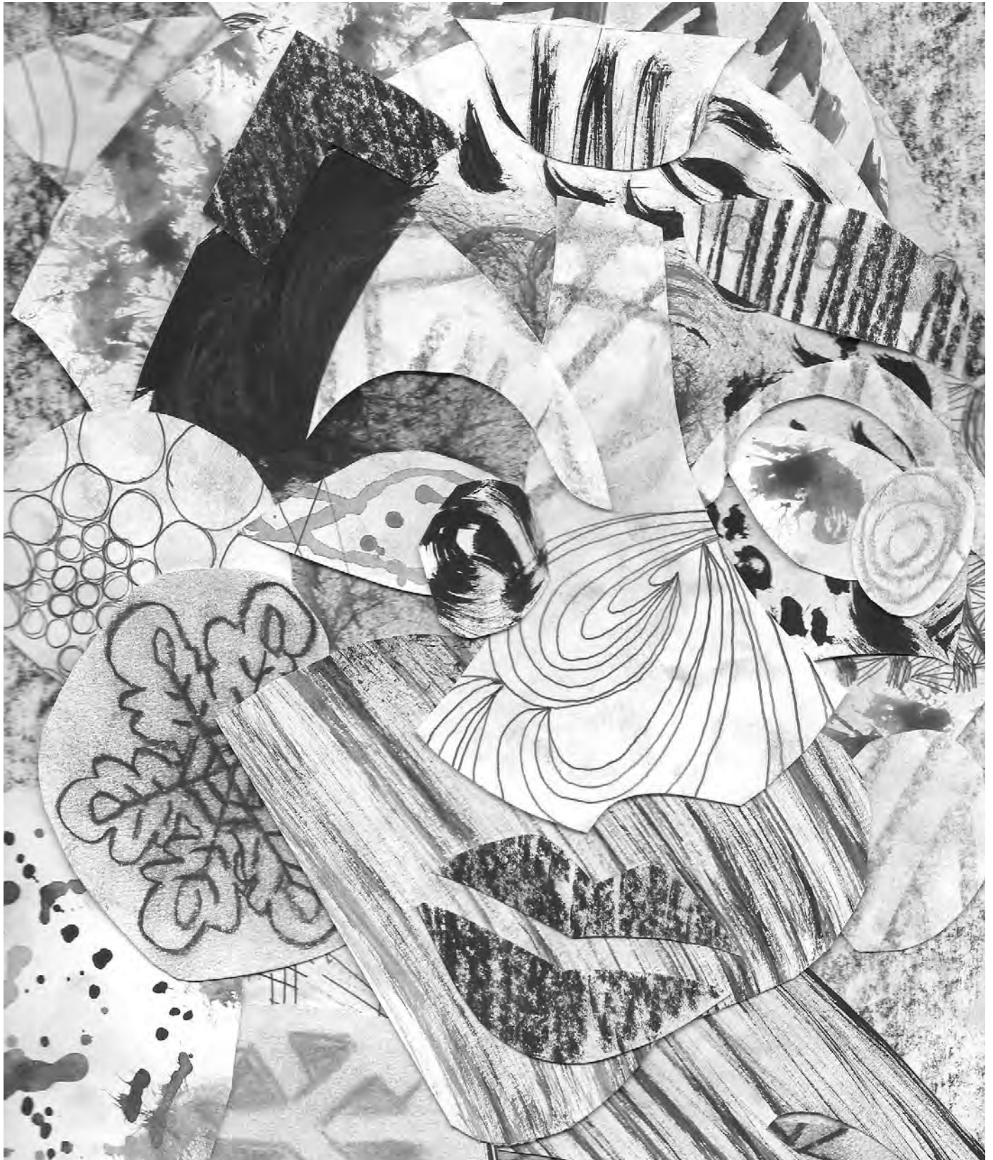
Katelyn Ackland A Puzzling Expression Two-Dimensional Art