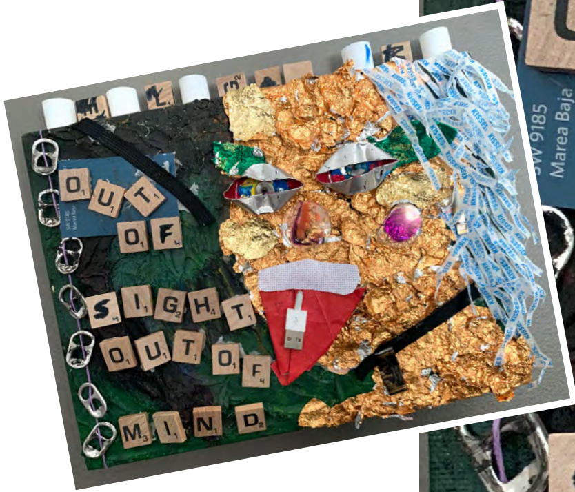
Elsie Gordon Untitled