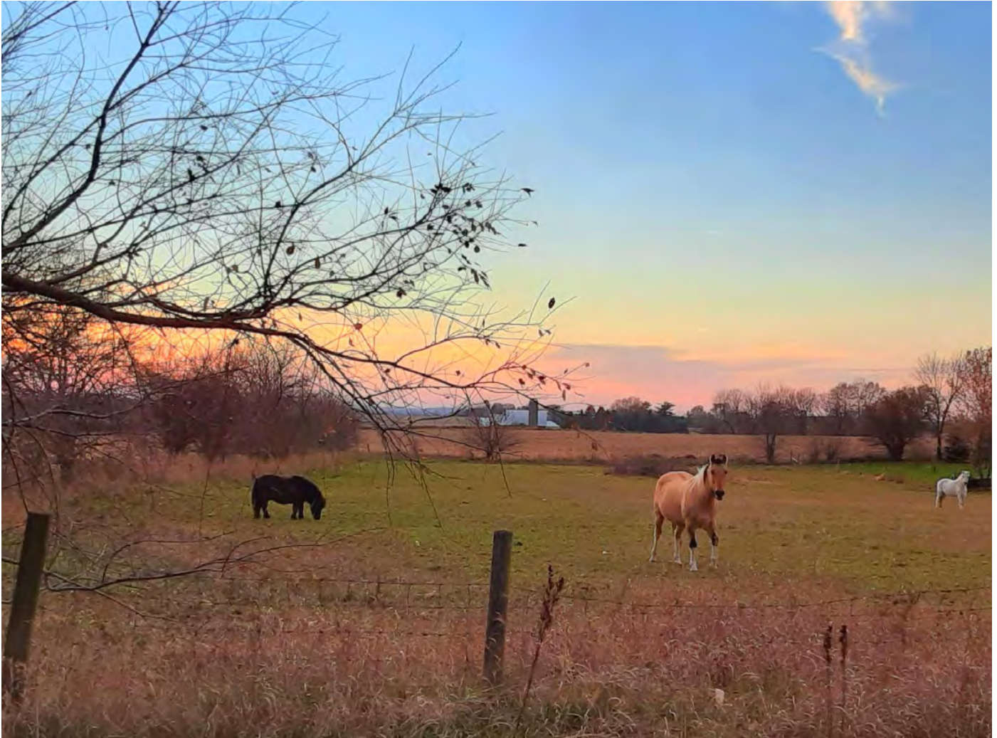
Katelyn Ackland Meandering in a Magical Meadow