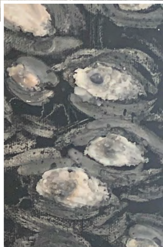
Elsie Gordon Grasp for Relevancy First Place Two-Dimensional Art