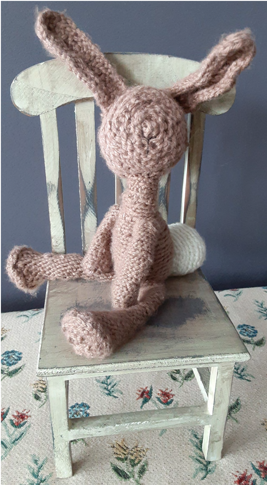
Katelyn Ackland Whimsical Wonders